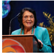
DOLORES HUERTA - Organizing for Justice