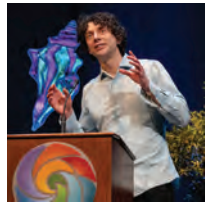
MERLIN SHELDRAKE - How Fungi Make Our Worlds